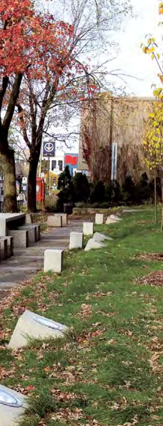
LEFT and BELOW: In this Montreal community, large outdoor furniture revises the idea of the street.