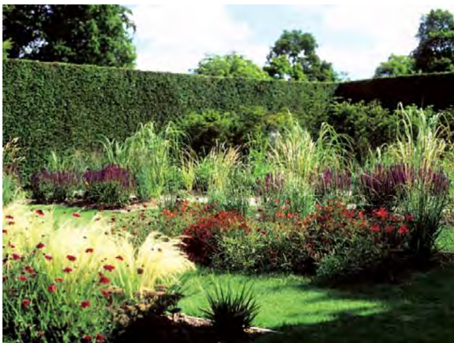
TOP: Demelza Garden, RHS Chelsea 2009.