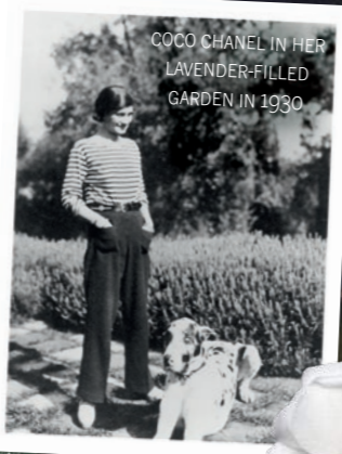
COCO CHANEL IN HER LAVENDER-FILLED GARDEN IN 1930