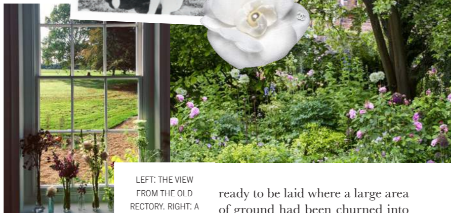
LEFT: THE VIEW FROM THE OLD RECTORY. RIGHT: A GARDEN-PLANTING DESIGN BY JO THOMPSON

as long as the rapacious squirrels haven't eaten the thousands of bulbs carefully hidden beneath the grass. One of the features that I love most about the house is its tall Regency windows, which look out onto every aspect of the garden. The borders have been designed with this in mind, featuring bounteous quantities of my favourite flowers (including a delightful array of roses given to me as a leaving present by the charming team