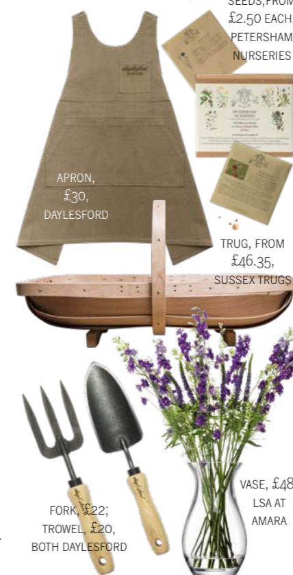
SEEDS, FROM £2.50 EACH, PETERSHAM NURSERIES